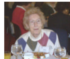
Past National President

It was our pleasure, too, to welcome so many of